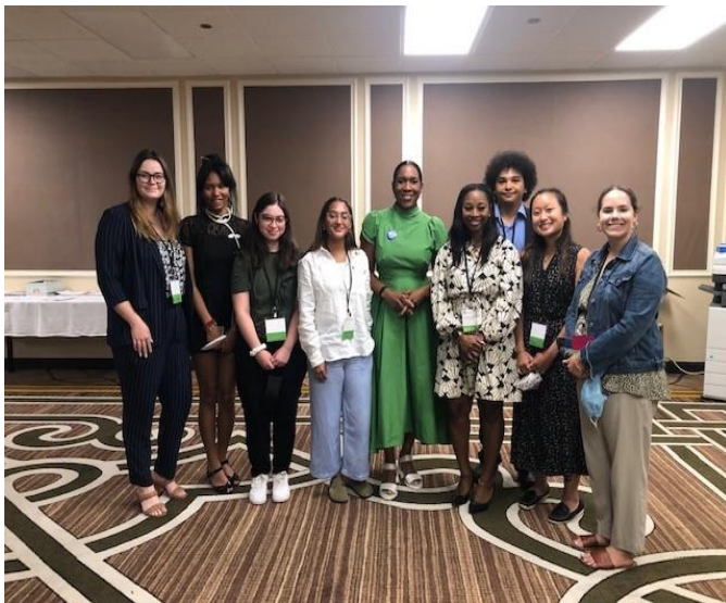
Staff greeted Lt. Gov. Stratton at the NOW National Conference in Chicago, IL.

The NOW National Conference held in Chicago, IL included 310 registrants! The Staff worked hard around the clock to ensure that members and special guests felt welcomed and supported. The feedback that the NAC received from members will be taken into consideration for future National Conferences. Each department has completed a debrief from the conference to improve membership experiences.