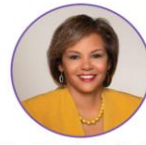
Rep. Robin Kelly (IL-02) @reprobinkelly Keynote Speaker