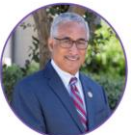
Congressman Bobby Scott (VA-03) @bobbyscott Panelist