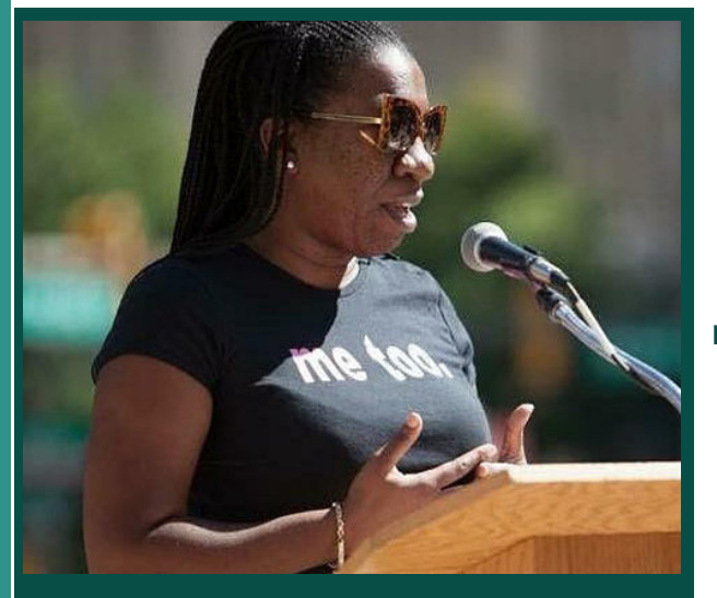
Tarana Burke, the founder of the #MeToo movement

As we have addressed, sexual violence perpetrated against Black women is often ignored or dismissed due to untrue biases regarding their sexuality. However this myth and other very real issues have influenced the number of Black women who report sexual assault. For every 15 Black women who are raped, only one reports her assault. In recent years, there has been an outcry on many Historically Black Colleges and Universities (HBCUs) on the system of silence that has existed around rape for many of their female students.